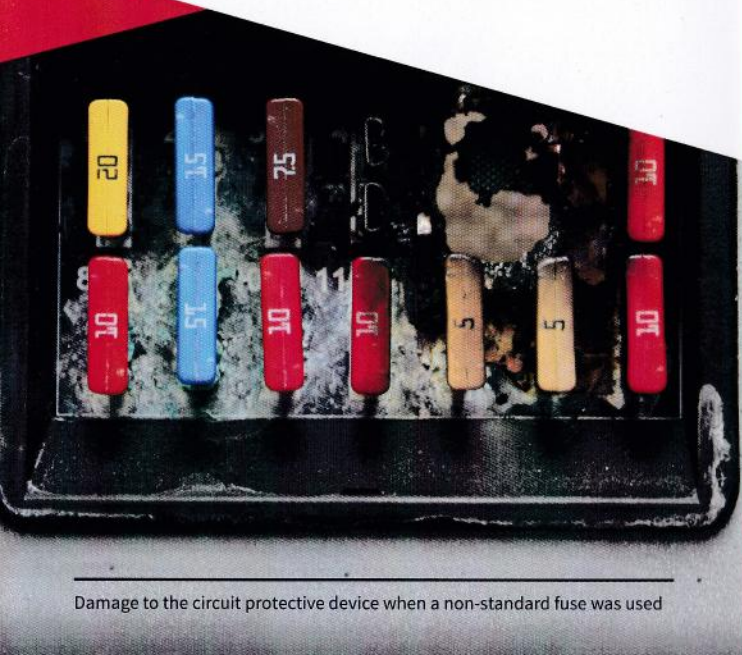
Damage to the circuit protective device when a non-standard fuse was used

Above Image: This damage occurred when someone drilled from the outside of the motorhome without checking what was on the inside