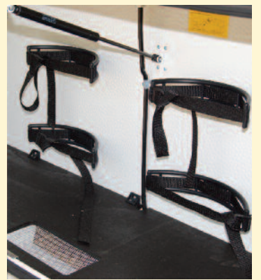
Some storage compounds insist you take out your gas cylinders. At least disconnect and fit any appropriate plugs

Wherever you're storing your caravan, it is essential that the gas valves on top of the cylinders are closed or the regulators (if a clip-on type) are disconnected from the cylinders and caps or cloths are fitted over the ends of any open pipework.